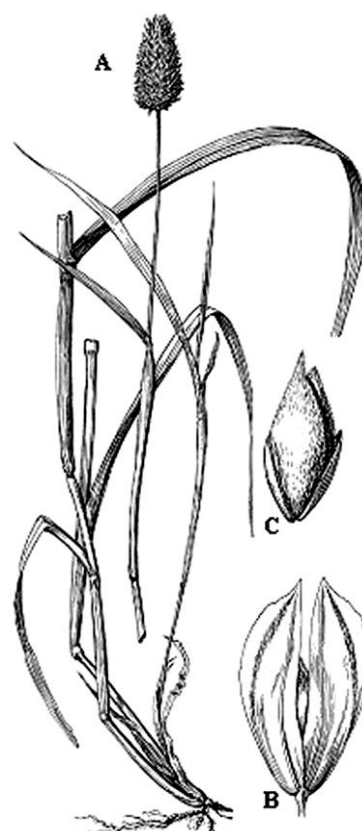
Figure 1. Illustration of canaryseed plant. References: (A) panicle; (B) spikelet; and (C) hairy hulled grain.

Yagüez (2002) mentioned that in small amounts, canarygrass grains have been used to produce sizing for cloth or distillates for alcoholic beverage production.